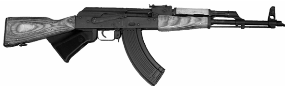
MonsterMan grip equipped "featureless" rifle

Examples 3 & 4: detachable magazines, but no other SB23 features: