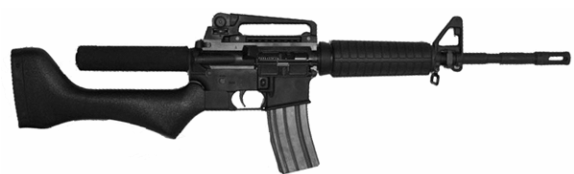
U15 stock equipped "featureless" rifle